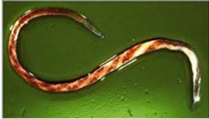
Figure 1. Barber pole worm ( Haemonchus contortus )

The FAMACHA ® system was developed in South Africa to estimate the level of anemia in sheep and goats associated with barber pole worm ( Haemonchus contortus ) infection and use that information to make deworming decisions.